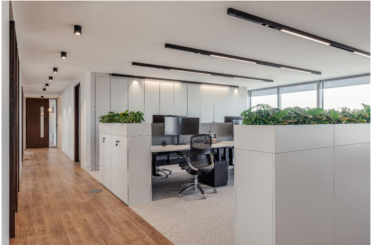
Open Plan Area