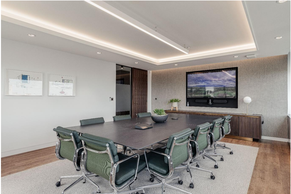
Meeting Room 2