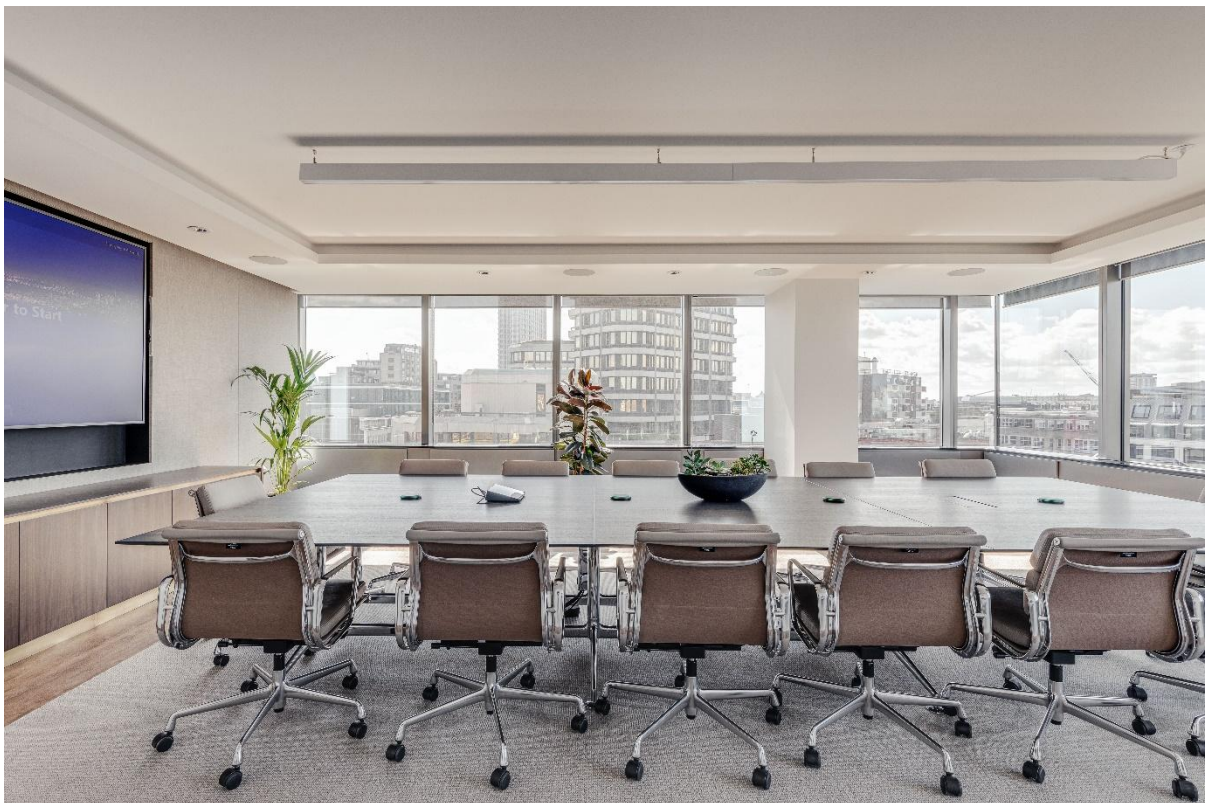
Meeting Room 1