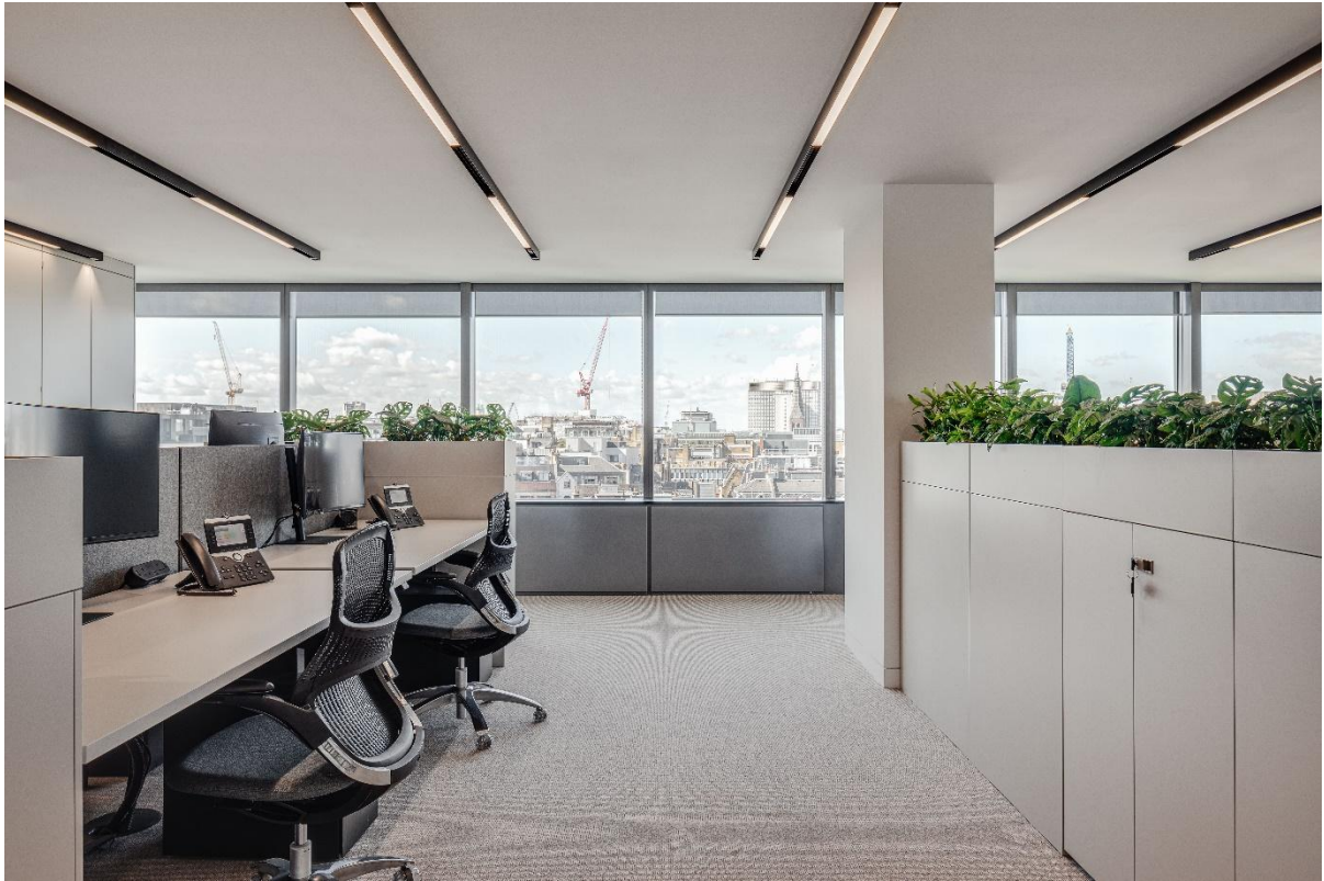
Open Plan Area