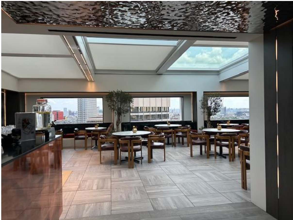
The Met Lounge